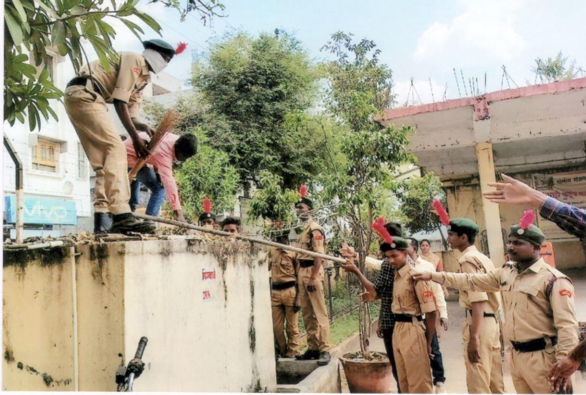
26 OCT 2021 The NCC department organized SWACHTA ABHIYAN AT DHARMABAD POLICE STATION at for this event police staff and NCC cadets were present .