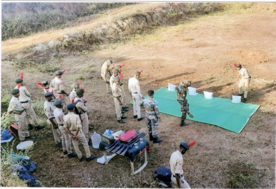
17 NOV 2021 ATC Camp Firing at Dharmabad .