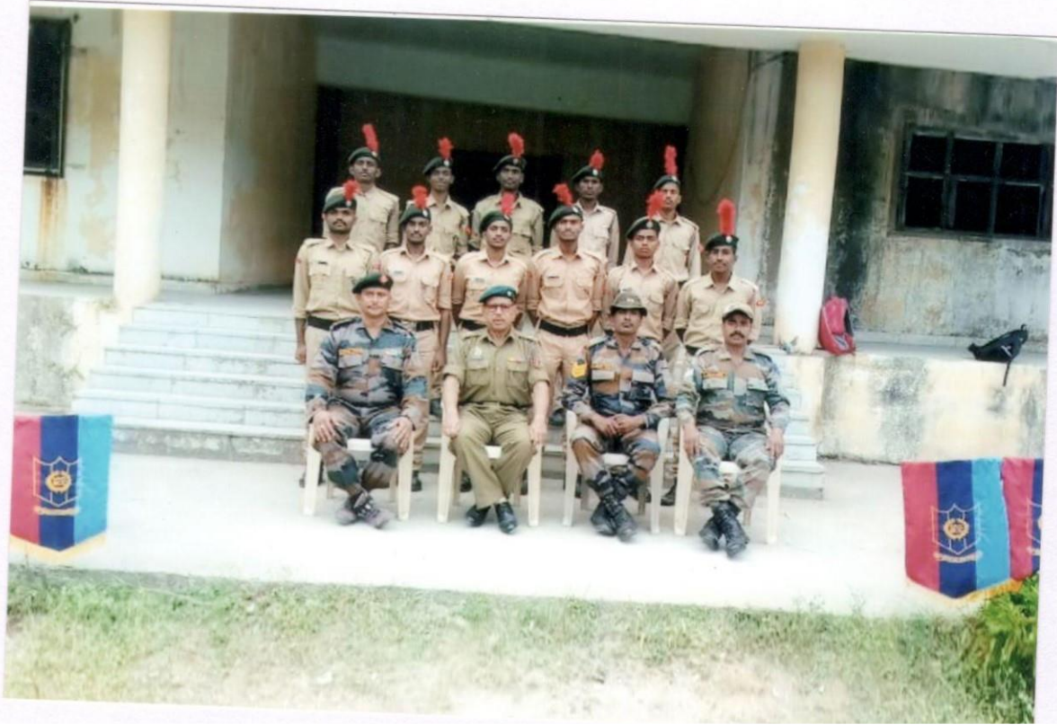
19 NOV 2021 The closing address Of B – certificate cadets .